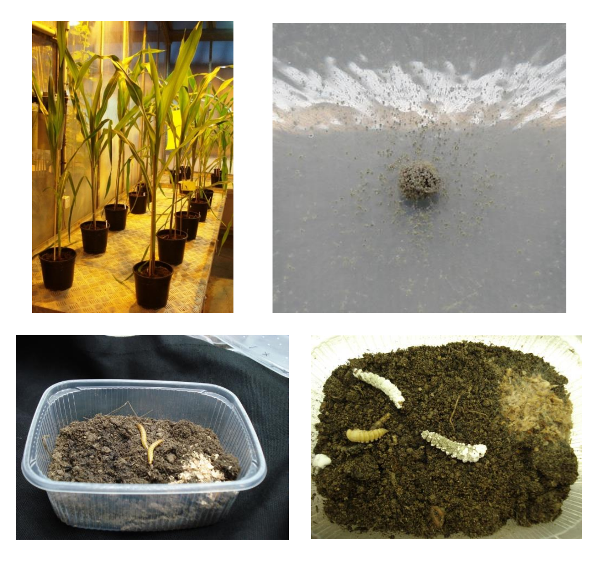
Fig. 2: Experimental set up of greenhouse trial to test different BIPESCO 5 formulations (TOP left picture); Metarhizium brunneum growth from a capsule (Formulation TYPE II) (TOP right picture); Quality control of Metarhizium brunneum infection with mealworm larvae (bottom pictures)

and V ) with BIPESCO 5 capsule formulations. The production, formulation, transport and application procedure of the BIPESCO 5 spores therefore did not significantly affect viability of the fungus.